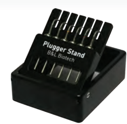
Plugger Stand Storage for B&L BL Pluggers