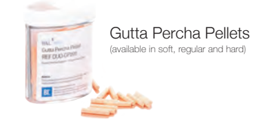
Gutta Percha Pellets (available in soft, regular and hard)

A PERFECT COMPLEMENT TO ALPHA2 – For the ultimate in warm vertical obturation efficiency, pair ALPHA A2 Cordless Heat Source with BETA Cordless Obturation Gun.