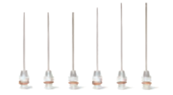
Needles (available in 21mm, 22mm, 24mm, 28mm & 50mm lengths and 20, 23 and 25 gauges)